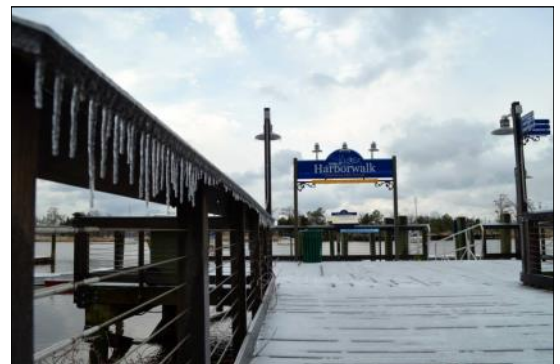
The Georgetown Harborwalk is shown covered in ice after a winter storm in January 2014.

In the South, near freezing temperatures are con-