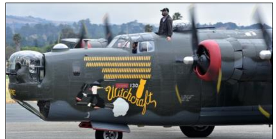
At top: Boeing B-17 The Flying Fortress. Above: B-24 Liberator "Witchcraft."

The tour travels the nation as a flying tribute to the flight crews who originally flew these aircraft, the ground crews who maintained them, the workers who built them, the soldiers, sailors and airmen they helped protect, and the citizens and families that share the freedom that they helped preserve. Since the tour's start, tens of millions of people have seen the B-17, B-24 and P-51 display at locations across the country.