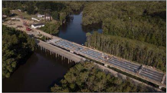
A mid-September aerial photo shows progress on the Yauhannah Lake Bridge.

There has been a need to temporarily close the southbound shoulder in the construction area for construction activities. This shoulder closure, between Lucas Bay Road in Horry County and Trinity Road in Georgetown County is between 7 a.m. and 5 p.m., and is expected to remain in effect for the duration of this project.