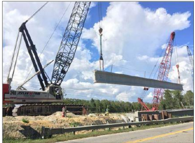
One of five girders is placed for the last span of the Yauhannah Lake Bridge. This span was not in place when the aerial photo above was taken.