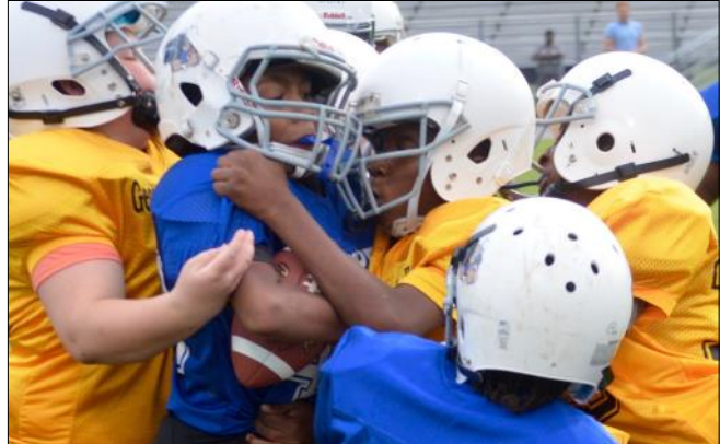
Youth tackle football games are now scheduled to begin on Oct. 20 after Hurricane Florence, flooding concerns and then Hurricane Michael took a full month away from the regularly scheduled season.

Fall youth sports will begin to get back to normal when youth tackle football games begin on Saturday, Oct. 20.