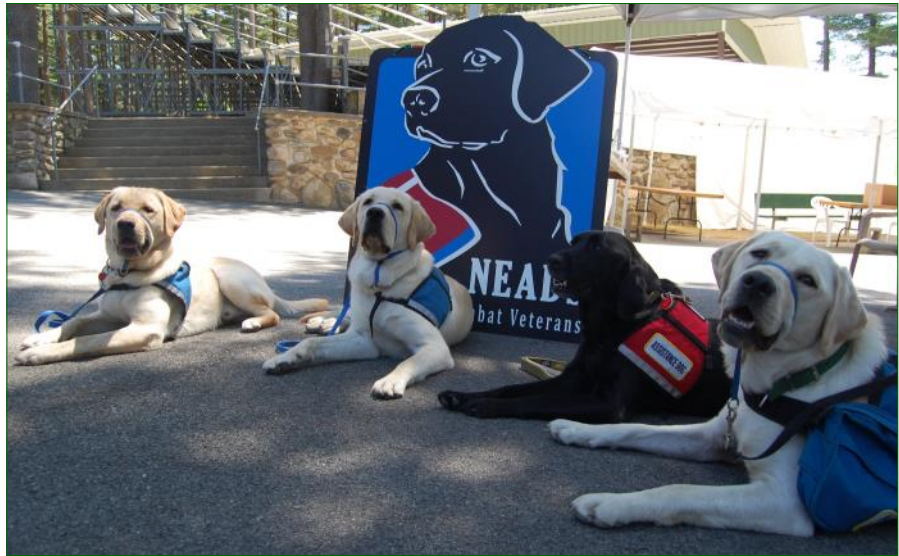
A presentation on service dogs from NEADS available to veterans will take place at the Waccamaw Library on Nov. 8 at 10 a.m.