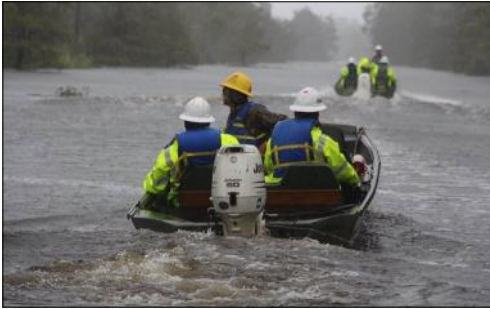
Employees from Santee Cooper travel to Sandy Island to work on restoring electricity after the worst of Hurricane Florence passed.

4, and possibly a Category 5 hurricane. Additionally, the storm was slow-moving and was expected to take its time battering our area, dropping as much as 40 inches of rain as it meandered across the Carolinas over the course of three days.