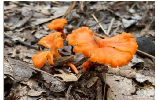
Chanterelles and other mushrooms can be spotted growing wild along the trails at Rocky Point. Chanterelles grow near live oaks from late May until the end of October.

Georgetown County and the Winyah Rivers Alliance, who jointly managed the scenic site, are planning even more offerings in the future.