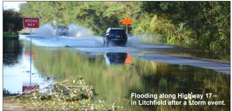
Flooding along Highway 17 in Litchfield after a storm event.

The public is being asked to assist in the master planning process by using an online mapping tool to show officials locations along the Waccamaw Neck where flooding and drainage system issues exist. The mapping tool can be accessed at georgetowncounty.publicprojects.geothing.com . The tool allows user to drop pins on specific areas of the map and offer details about