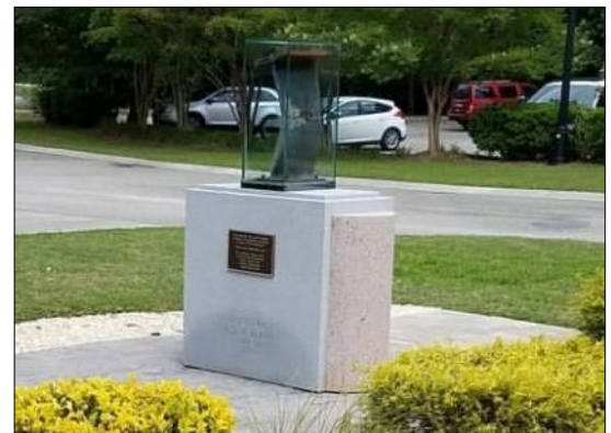
The remembrance ceremony will take place at 9 a.m. Sept. 11 at the 9/11 memorial in front of Midway.

The staff and volunteers at Midway will come to-