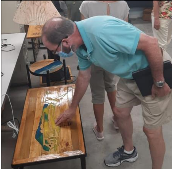
The Sheriff's Re-entry Program recently welcomed board members from Amazing Journey and volunteers from Club 142 of Pawleys Island for a party with a purpose. They priced more than 100 items that will be sold at the Wooden Boat Show on October 16 and 17. The funds will help inmates earn journeyman certification in high demand trades.