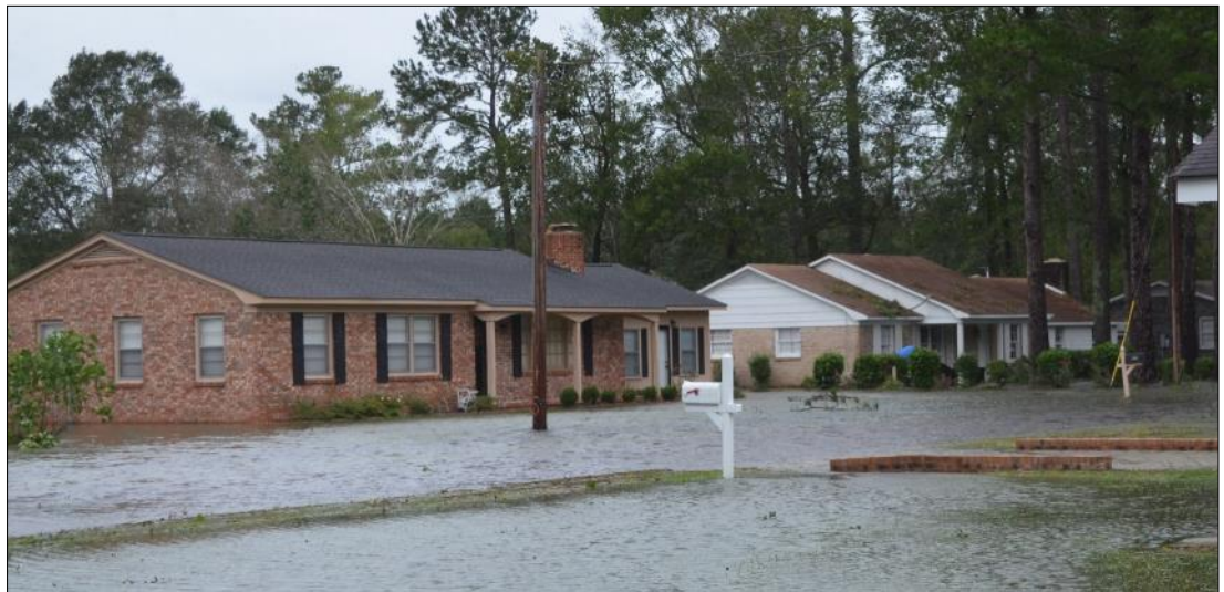
Floodwaters are shown on roads and yards off Highway 701 in Georgetown after a storm event.

In a coastal county with five Rivers, flooding is a major concern for most residents. A huge number of homes in the county are required to have flood insurance — and many more homeowners take out policies voluntarily. Flood insurance, unfortunately, can be quite expensive. But there are some steps residents can take to help reduce their rates.