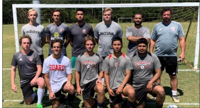
The Legends were the winners of this summer's Georgetown County Parks and Recreation adult soccer league championship.

The Georgetown County Adult Soccer League wrapped up its summer season with a series of playoff games on Saturday, August 6 and Saturday, August 13. Six teams – #1 Legends, #2 Georgetown United, #3 El Cerro Grande, #4 South Strand Fútbol Group, #5 LatinNet United, and #6 Internazionale Atlas – each fought their hardest to win the championship.