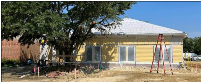
Top: Georgetown Library staff have worked tirelessly to get the library packed up and ready. Above: The view of the new addition from Cleland Street.