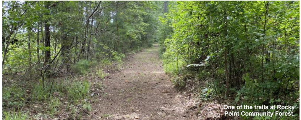
One of the trails at Rocky Point Community Forest.