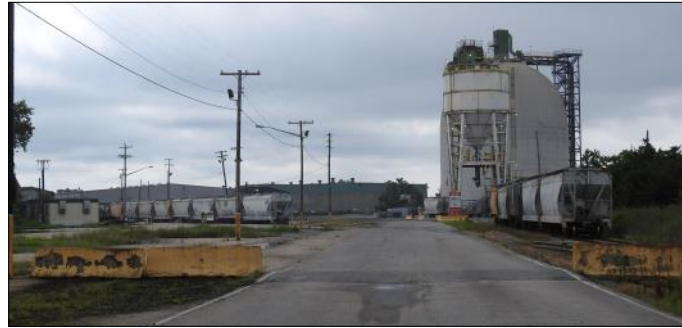
View of the port including areas currently under lease by companies including Holcim and International Paper.

As activities move forward at the port, the county will be seeking public input. Anyone who would like to be part of that and learn about future meetings and public input sessions regarding the port should sign up for notifications under the "Calendar" heading at https://www.gtcounty.org/list.aspx .