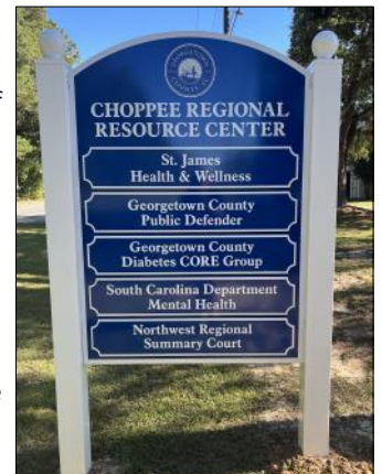
From top: The refinished auditorium stage, new auditorium seating and a new sign at the facility.