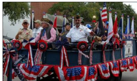
A float from the 2022 Veterans Day Parade in Georgetown.