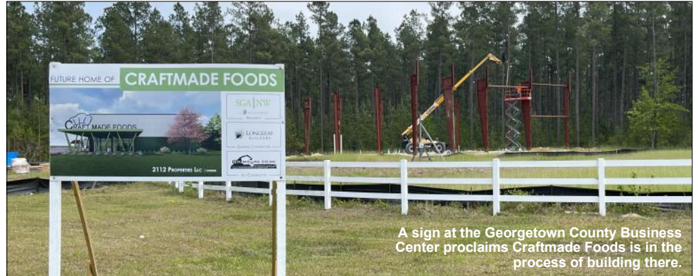
A sign at the Georgetown County Business Center proclaims Craftmade Foods is in the process of building there.

The Georgetown County Economic Development Department has had its hands full lately, and a drive through the county's industrial park in Andrews offers a good idea of what department staff has been up to. Companies are not just building structures at the park; they are laying the groundwork for economic prosperity.