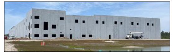
A new building under construction by Zilmet USA.

Thomas & Hutton have been engaged to provide infrastructure updates to the property, including widening the Sampit channel to facilitate barge access for Project Current or other potential users. The work was made possible by a $1.3 million grant from the S.C. Department of Commerce.