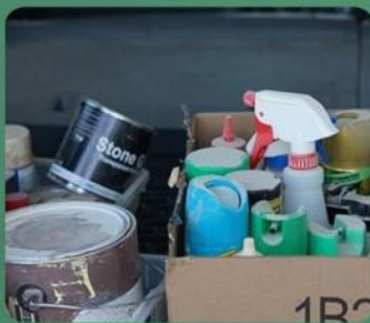
Household Hazardous Waste Collection