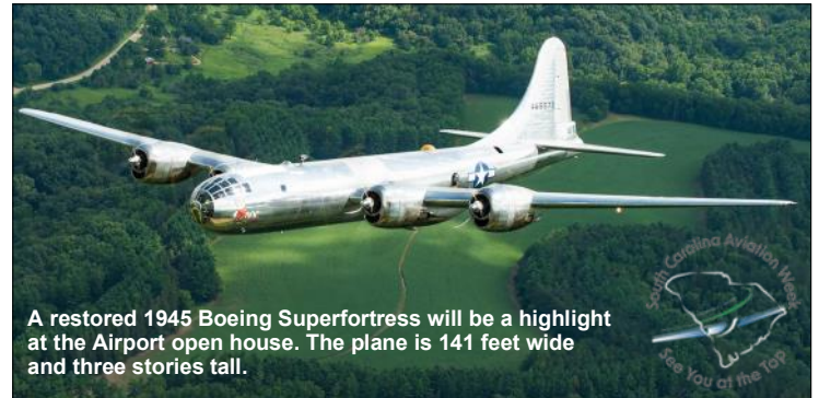
A restored 1945 Boeing Superfortress will be a highlight at the Airport open house. The plane is 141 feet wide and three stories tall.