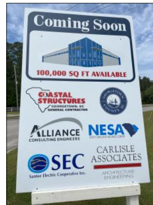
Construction will start later this year on a new spec building at the industrial park in Andrews.

All of the Voluntary Cleanup Contracts for Phase I of the environmental site assessment have been completed. Georgetown County is now engaging GEL Engineering to move forward with the second phase of the assessment.