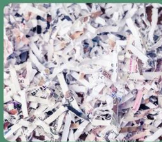
Paper Shredding Truck