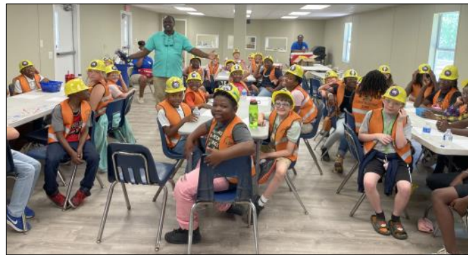
As part of the celebrations, staff met with local students to teach them about Public Works and encourage them to consider Public Works as a future career.