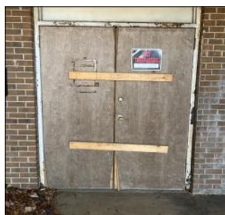
Winyah Gymnasium in Georgetown is among many sites that could qualify for assessment with the grant funds.

The funds come in the form of a Brownfields Assessment grant from the Environmental Protection Agency. These grants can be used by communities for the purpose of inventorying and assessing brownfield sites, as well as conducting planning activities, developing site-specific cleanup plans and engaging community members in the process. The county received the