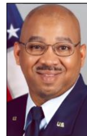
By David Murphy

If you are still receiving paper check for your pension and compensation, please consider changing to direct deposit. You can make this change by calling 800-827-1000. They can take your routing and checking information and upset you file instantly.