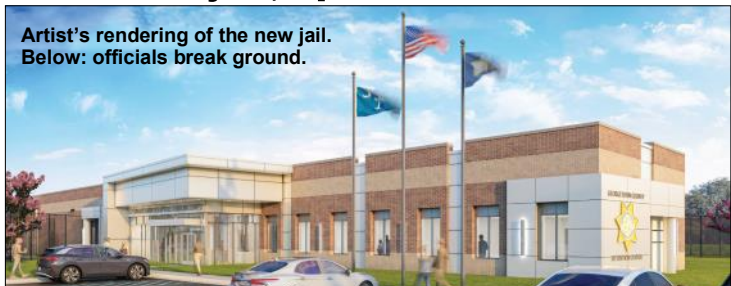
Artist’s rendering of the new jail. Below: officials break ground.

“This groundbreaking signals a new era for public safety in