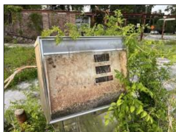
An example of a site that could be eligible for assessment under the brownfields grant.

To help ensure outcomes that will be most beneficial to the communities eligible for these grant funds, the County is seeking volunteers for