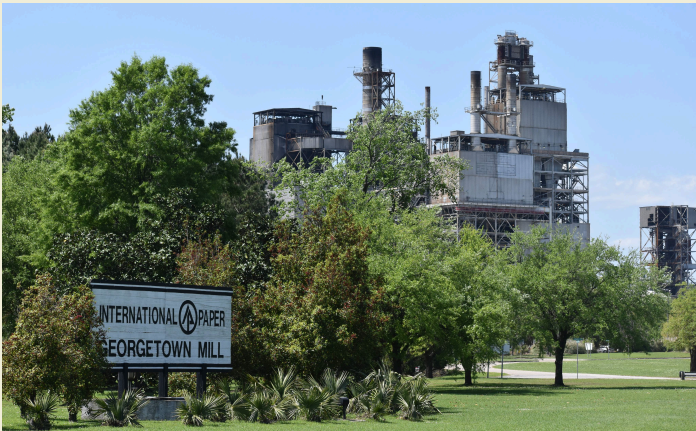
The IP mill sits idle since operations ceased at the end of last year.

In the wake of the recent closure of the International Paper mill, Georgetown County and the City of Georgetown are keeping a close eye on the future of the property and the potential it holds for economic growth and job creation.