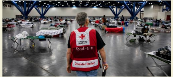
A training session on May 10 will prepare new volunteers to assist with shelter operations during a disaster.

The shelter training boot camp, scheduled for May 10 from 9 a.m. to 1 p.m., will provide attendees with the basic