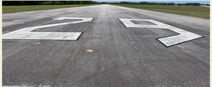
Runway 11/29, a secondary runway, is currently pocked by potholes.

"We're proud to take this important step in making the airport safer and more reliable for all users," Taylor said. "This reconstruction ensures that pilots have a safe crosswind runway available and allows for continued