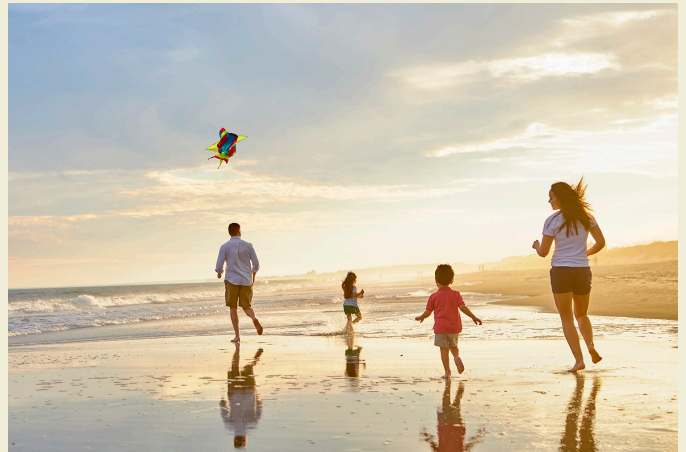
A family plays on one of Georgetown County's beautiful beaches.

This is not the first time a Hammock Coast community or attraction has been nominated in a USA Today/10 Best contest. Georgetown topped the Best Coastal Small Town contest in 2018 and was nominated again for many years.