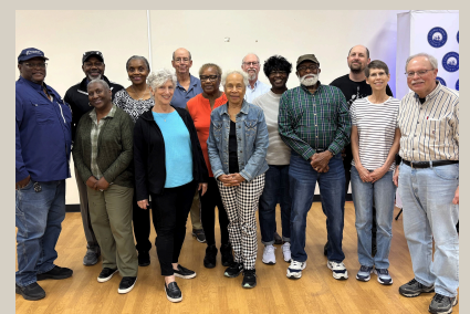
14 graduate from county's third annual Taxpayer Academy program