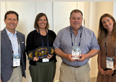
County receives national award for efforts toward employee well-being