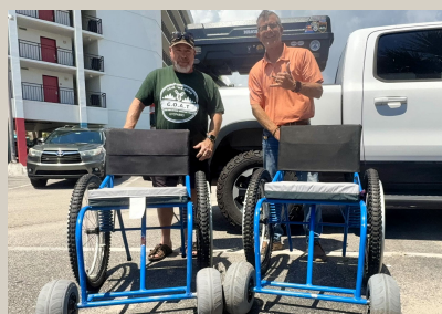
GOAT program receives all-terrain wheelchairs from the Adaptive Surf Project